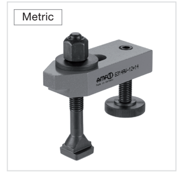
5 Type B With clamping bolt