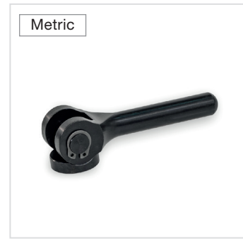
3 Type A Without contact plate B With contact plate