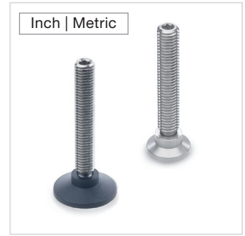
SS Stainless Steel