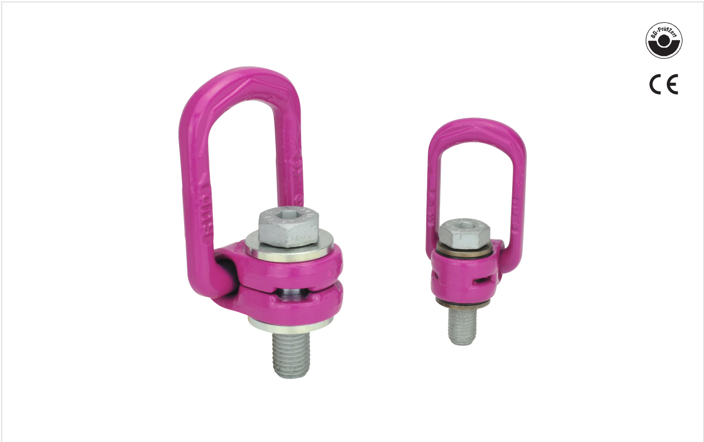
Dimensions in: metric tons