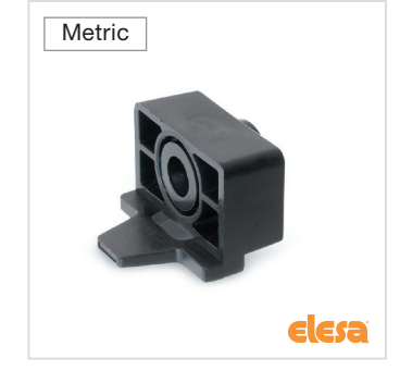
ELESA original design BPS.30-SP