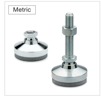
4 Type SV With damping pad