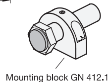
Mounting block GN 412.1