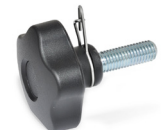
EN 5337.2 → page 602 EN 5337.7 → page 605 Size 32 ... 63 mm