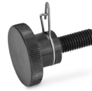
SS Stainless Steel DIN 464 → page 705 M6 ... M10