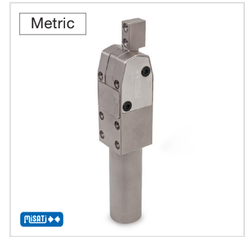
2 Type BI Vertical clamping arm