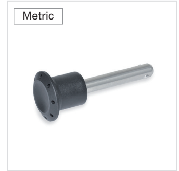
SS Stainless Steel